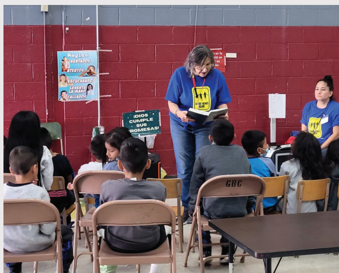
Previous page: Migrant families are processed by government officials. // At the El Paso Migrant Center. Top right: A man walks through rows of cots where migrants rest after months of travel. Middle: Migrant families participate in art activities. Bottom: Migrant children listen to stories from God’s Word.

Give God’s Word to migrants served by the El Paso Migrant Center. go.dbs.org/migrant